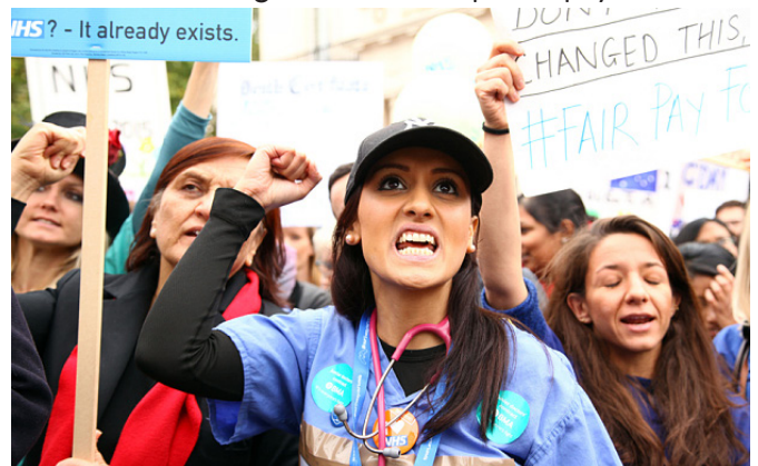
Junior Doctors on the march with supporters last October

We also need to plan for how to support consultants when they go into dispute with the government over contracts and agenda for change staff to beat the government imposed pay freeze.